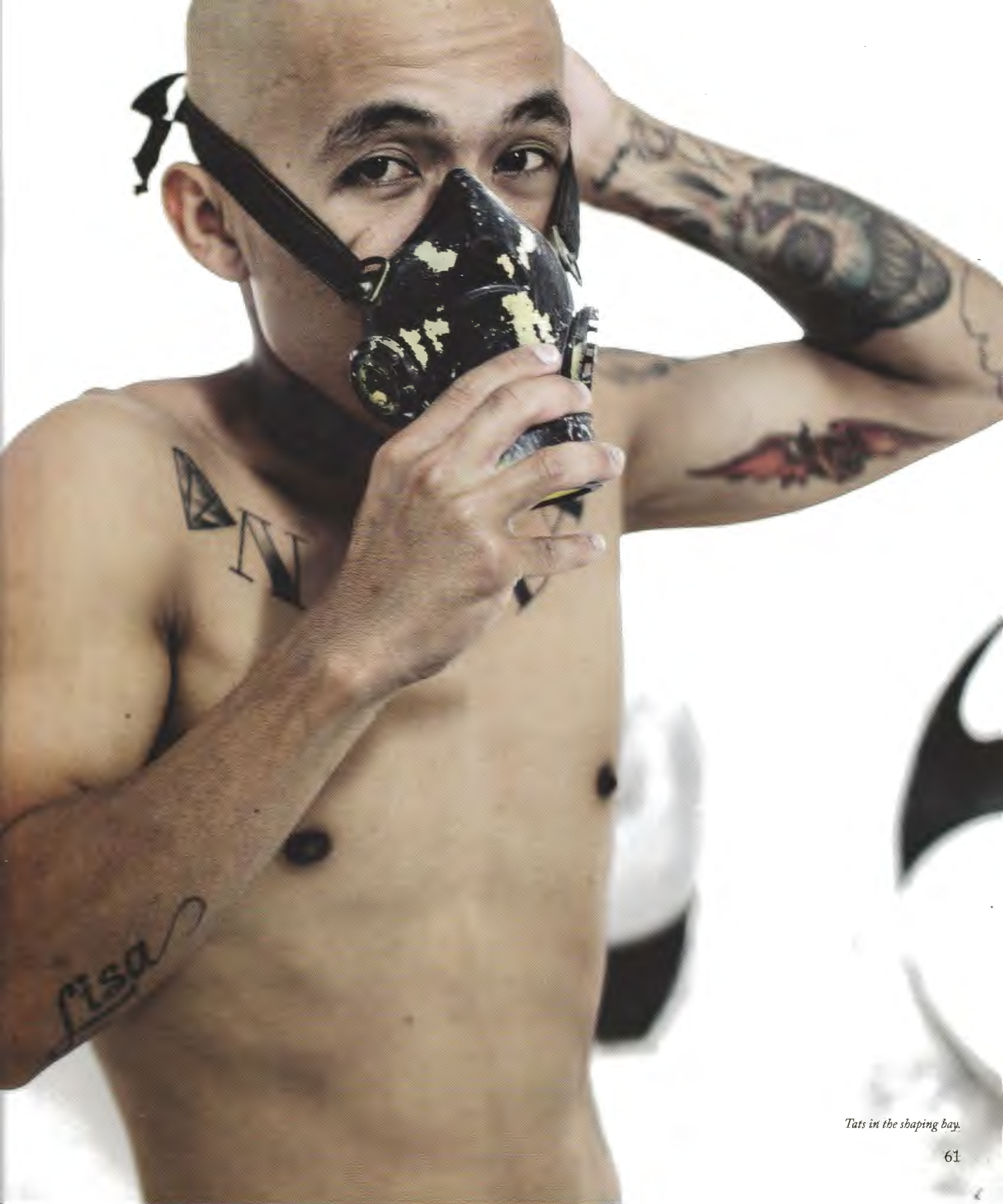
Tats in the shaping bay.