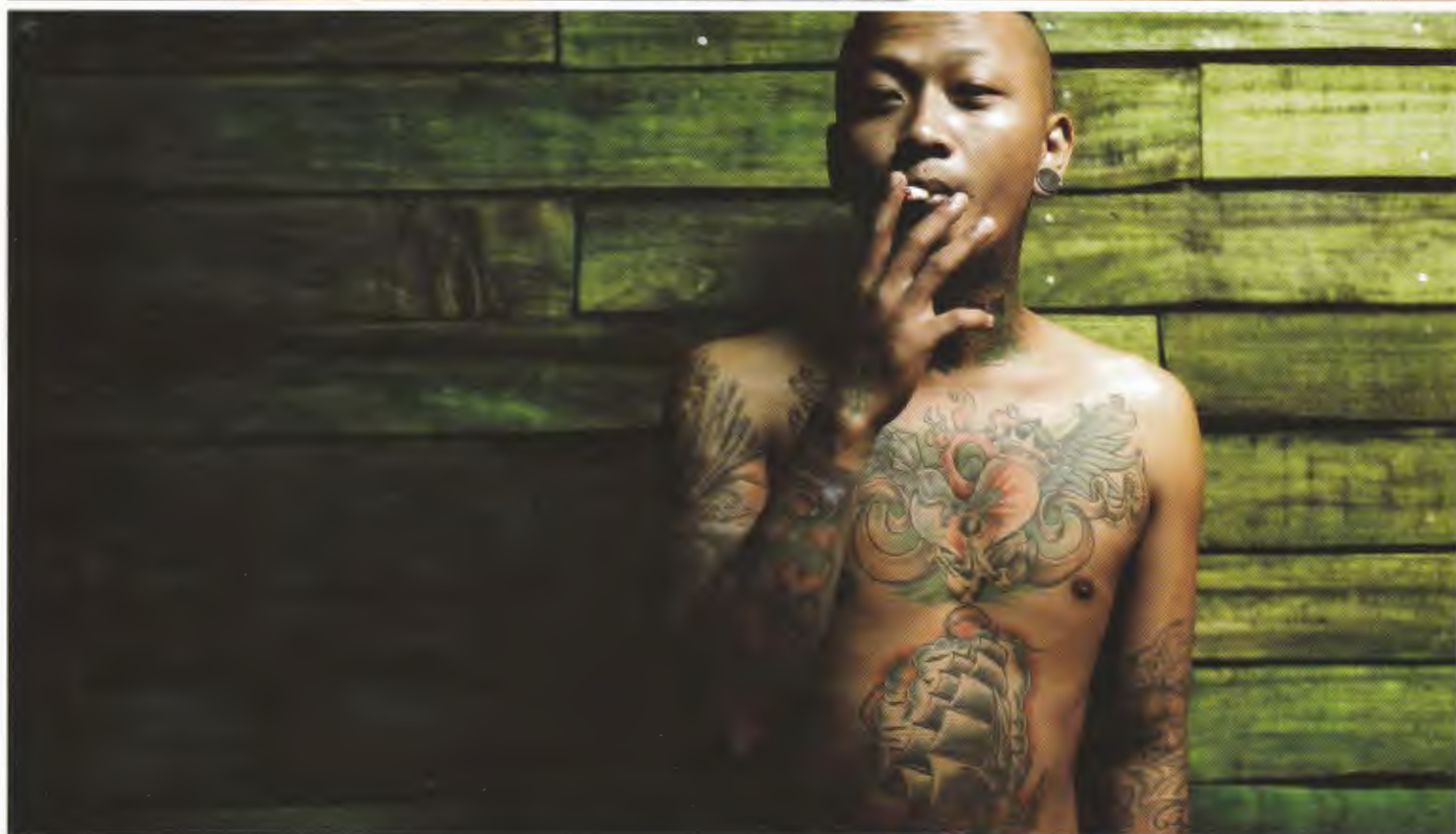
Body, mind and skull candy.